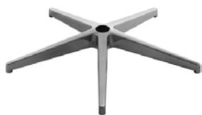
Pyramidal aluminium base d.700