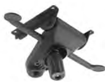
5 locking positions advanced pivot point tilting mechanism with tension control