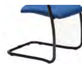
Black painted steel cantilever frame d.25