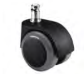
Soft castors d.50