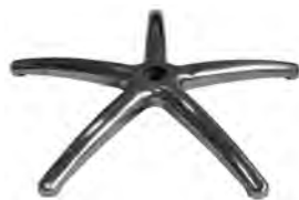
Aluminium base d.700